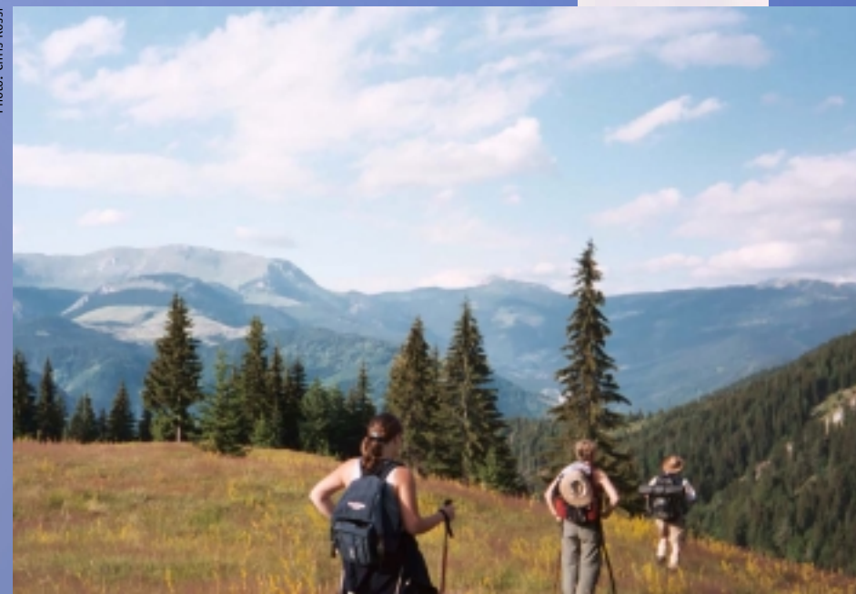
Hiking through Rugova's alpine meadows with a guide.