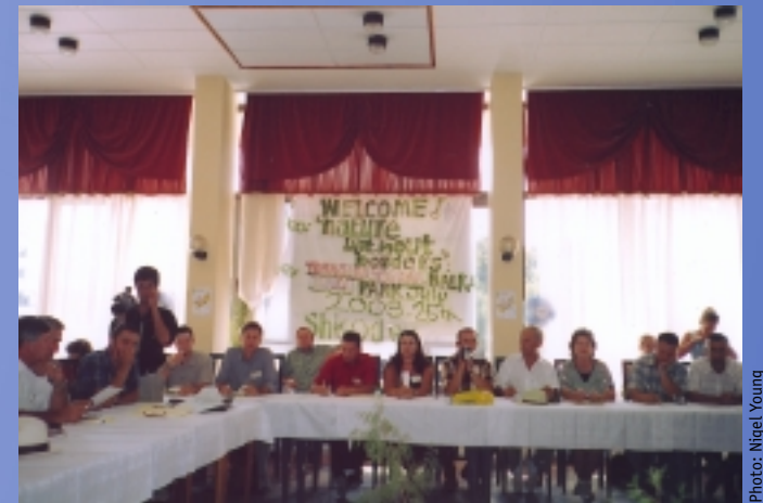
Conference participants discuss future plans for the Peace Park.

The trek concluded with a conference in the Albanian city of Shkodra. The NGO, IRSH worked to make this a success with funding from the US Embassy in Tirana. Approximately 100 participants, both local and from further afield, discussed future activities for the development of the Peace Park. The conference also served as a debriefing for trekkers and the media. At the end of the conference there was still time to enjoy Shkodra, the beautiful city of Illyrian origin with its ancient castle and magnificent lake.