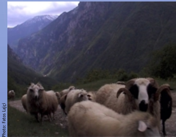
Sheep on a mountain road in the Rugova Valley, Kosovo/a.

The trek was designed to travel through areas which had particularly suffered from conflict and to visit villages destroyed by war. In Kosovo/a, it was necessary to seek advice concerning the location of remaining landmines. Following the 1999 War rebuilding took place at a great pace. However, four years later, hundreds of families, especially in the rural areas, were still living under blue plastic sheeting. Despite this, trekkers were greeted with traditional hospitality.